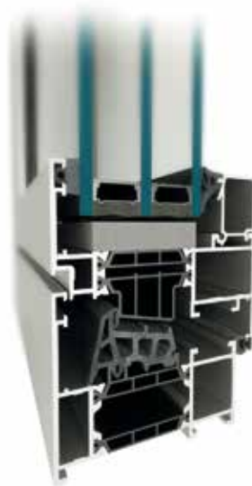
MB-79N ST window