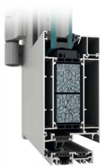
MB-79N SI+ door