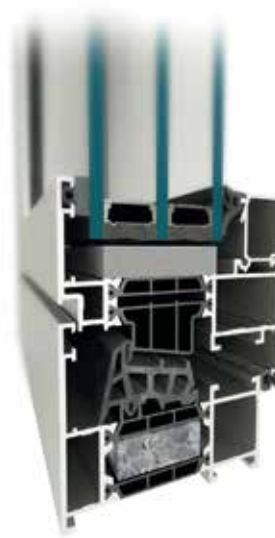
MB-79N SI window